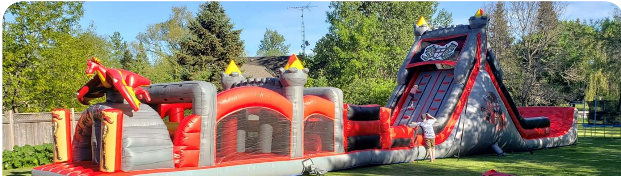
• 75' Excalibur Obstacle Course