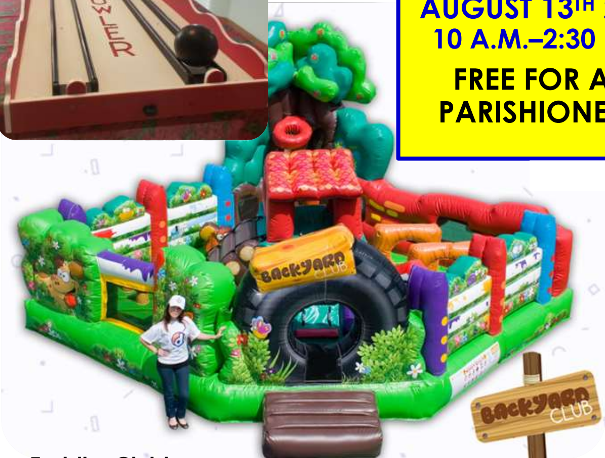
• Toddler Clubhouse