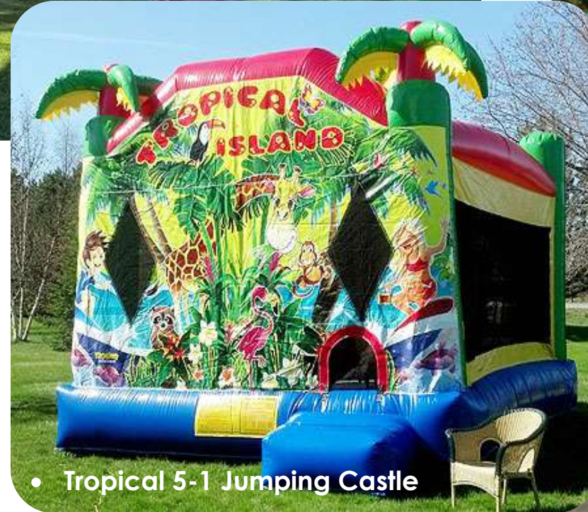
• Tropical 5-1 Jumping Castle

ST. JANE FRANCES CHURCH FAMILY FUN! SATURDAY, AUGUST 13 TH 2022 10 A.M.-2:30 P.M. FREE FOR ALL PARISHIONERS!