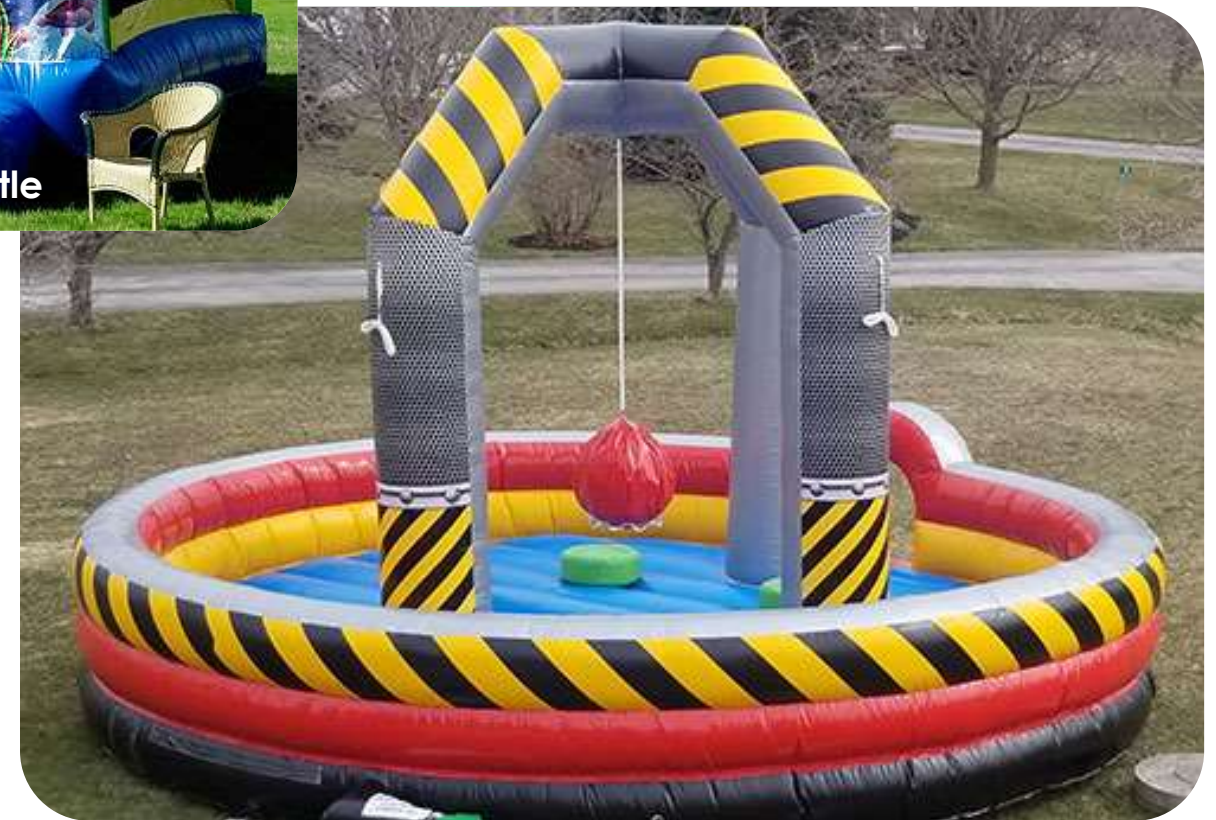
• High Voltage Wrecking Ball Game